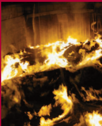
Fire from self-heating of DRI

Some cargoes are particularly reactive and so need to be 'aged' by exposure to air, ensuring that the most easily-oxidised parts have reacted before loading.