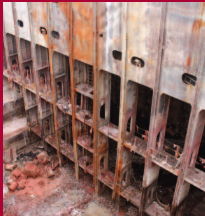
Effects of an incident involving reactive solids in a container ship hold