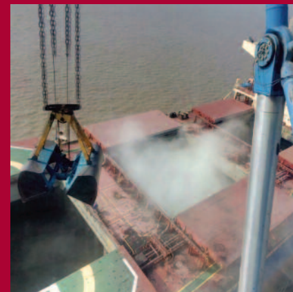
Self-heating of coal