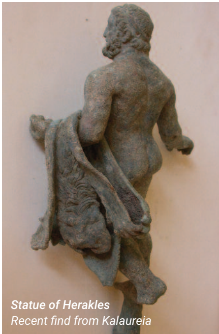
Statue of Herakles Recent find from Kalaureia

Yet both countries have a long shared history.