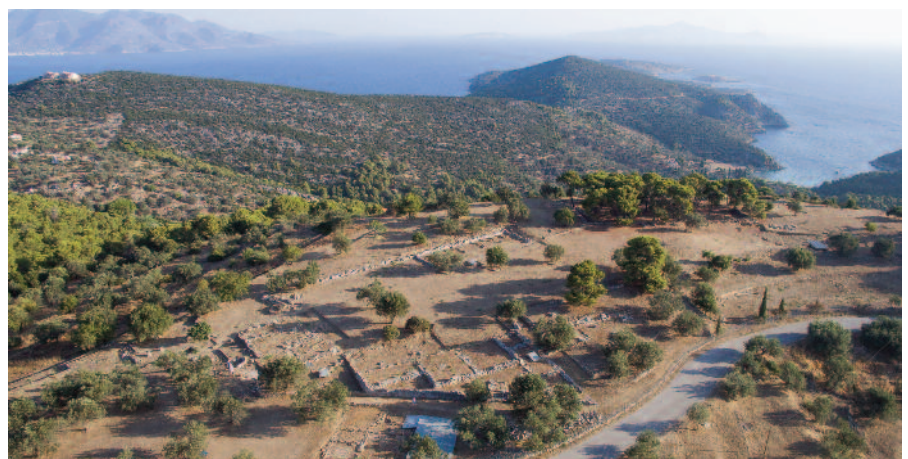
The Sanctuary of Poseidon at Kalaureia

The most recent find is a small statue of Herakles, Poseidon's nephew. Found next to a wall in a house that was being renovated, it was buried in order to bring luck to the owners of the house. 🍀