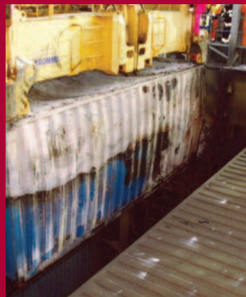
Effects of a fire in a container involving rechargeable batteries