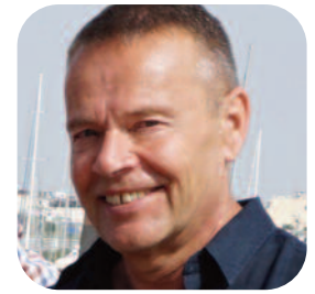
By Arto Penttinen, Director of The Swedish Institute at Athens

Both Sweden and Greece are typical examples of North and South respectively, and it can be difficult to imagine any relationship between them.