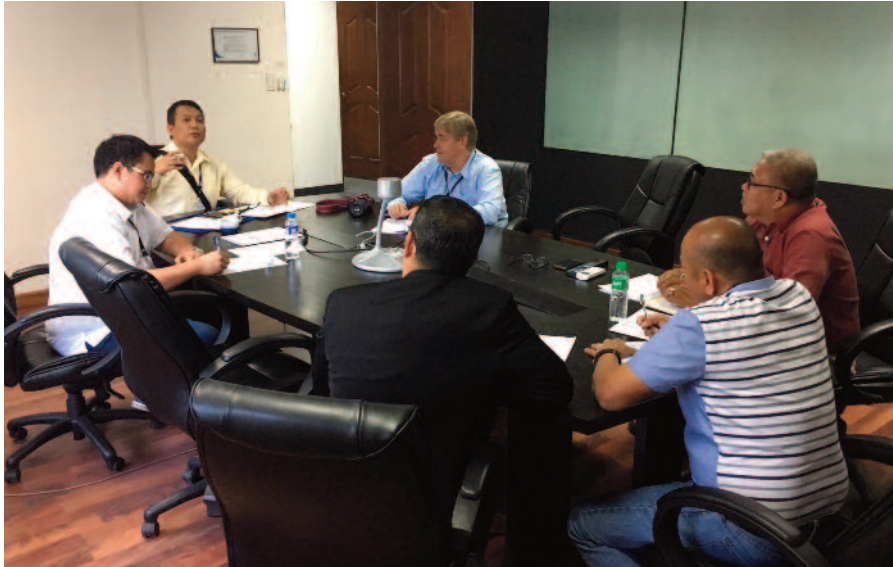
Workshop during the MRM User Seminar in Subic Bay 26-27 October 2016