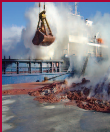
Unloading self-heating DRI