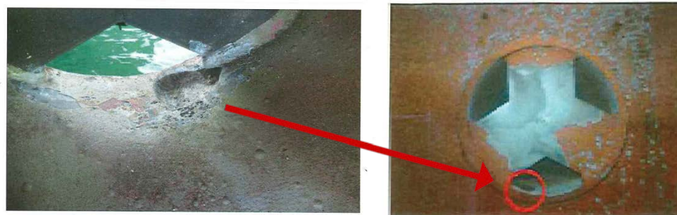
Picture 2 Corrosion around weld between distance piece and bluff body

Upon the above incidents, ClassNK would like to recommend the owners and the managers as follows: