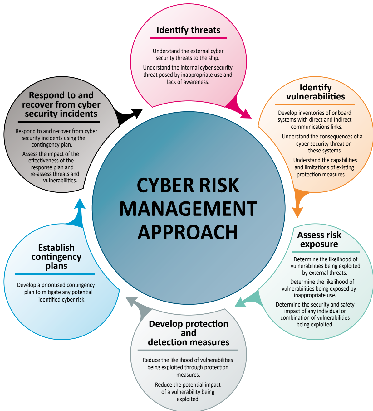
Figure 1: Cyber risk management approach as set out in the guidelines

Some aspects of cyber risk management may include commercially sensitive or confidential information. Companies should, therefore, consider protecting this information appropriately, and as far as possible, not include sensitive information in their Safety Management System (SMS).