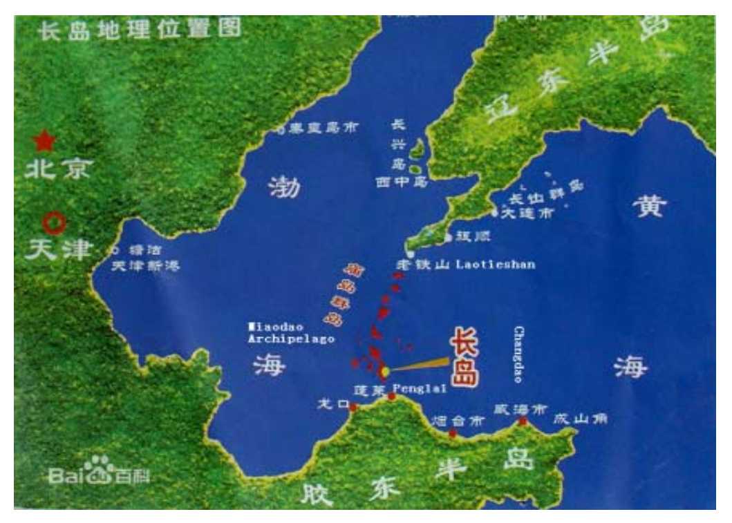
location map of Bohai-sea

The separating line betweenBohai Bay andYellow Sea is the line (marked in red in below map) from the west corner of Lao Tie Shan(approximately 38°43.663N, 121°08.082E) located in the south of Liaodong peninsula to Peng Lai Jiao (approximately 37°49.931N, 120°44.575E) located in the north of Shandong peninsula via Miaodao Archipelago.